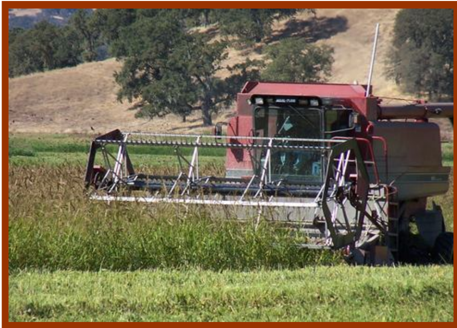
Wild Rice Harvest