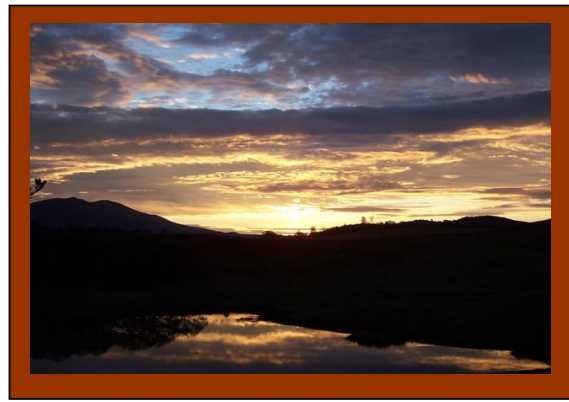
Sunrise by Konocti