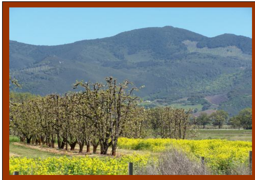
Pear Orchard in Kelseyville

1 INCLUDES APPLES, PEACHES, STRAWBERRIES, MELONS, DRIED FRUITS, OLIVES. ETC.